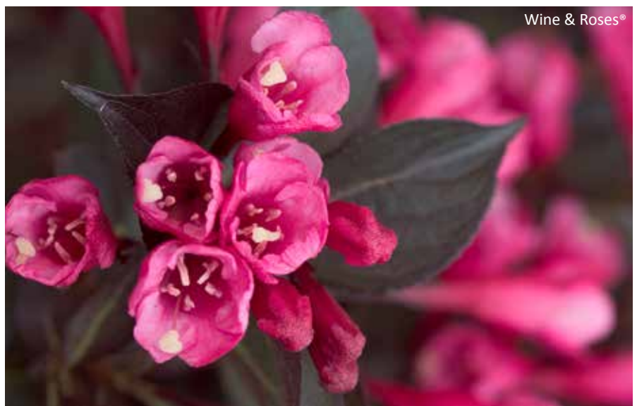
Wine & Roses®